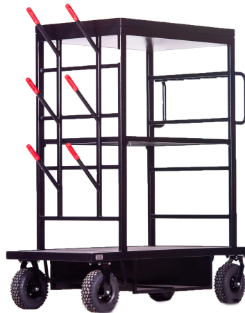
HMI CART Heavy Duty cart specifically engineered for the efficient transportation of HMI lighting equipment. $40/Day