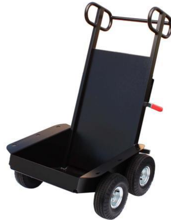
MUSCLE CART w/ 20 Sandbags $65/Day